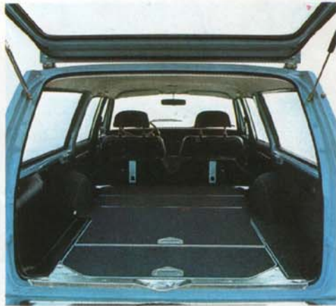
You can carry 67 cubic feet of food and refreshment to a tailgate party. And if it rains, you can hide under the tailgate.