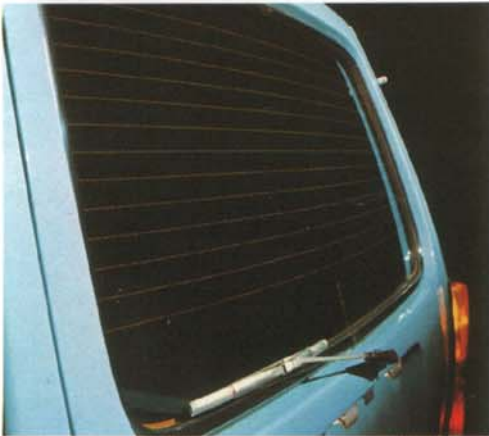
Visibility is unusually good through the back window because it's equipped with an electrically-heated defroster and its own wiper and washer.