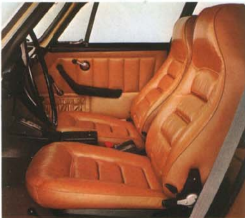
The bucket seats adjust forward, backward, up, down. The backrests adjust from upright to horizontal. Lumbar support is adjustable. Seats are covered in leather.