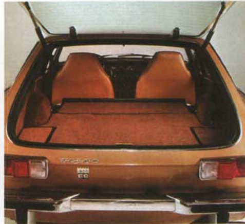
The new 1800ES can carry 35 cubic feet of luggage. Which is not only great for a sports car, but not bad for a sedan.