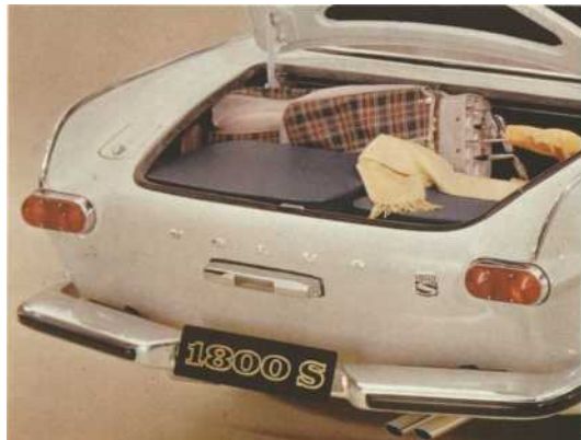
Exceptional luggage capacity.