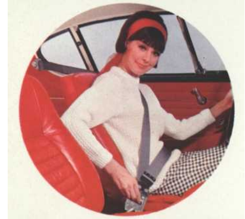
All controls are easy to reach with the seat belt firmly on.

AS ROAD AND TRACK MAGAZINE PUT IT, "The 1800 S is a very civilized touring car for people who want to travel rapidly in style."