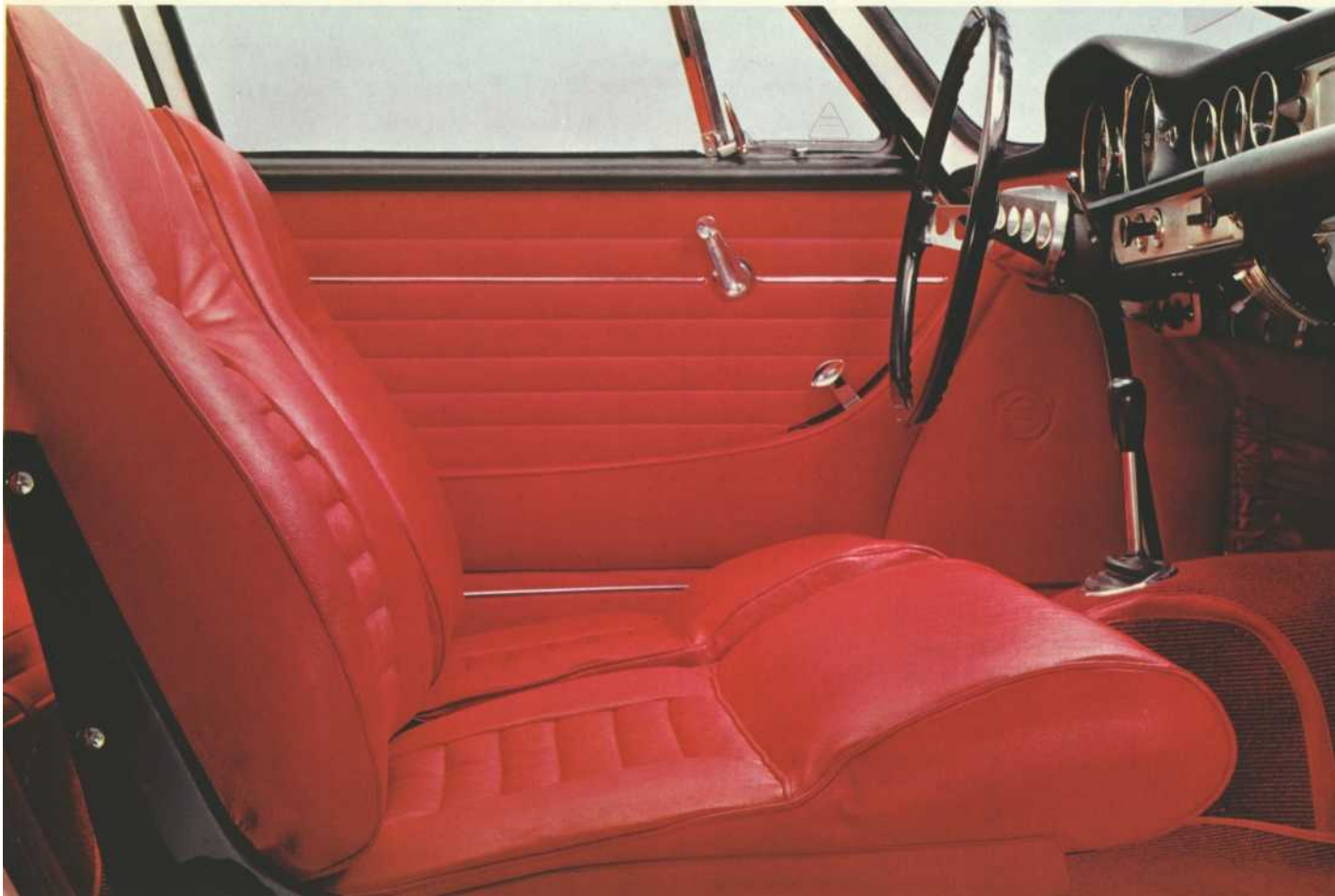
Almost infinitely adjustable seats - try them for size