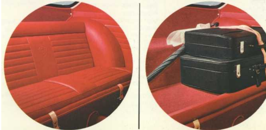
Occasional seating behind the driver . Very exceptional luggage carrying capacity with leather strap tie-downs.