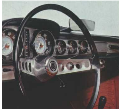
Speedometer and tachometer immediately in front.