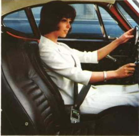
Safety belts included in standard equipment