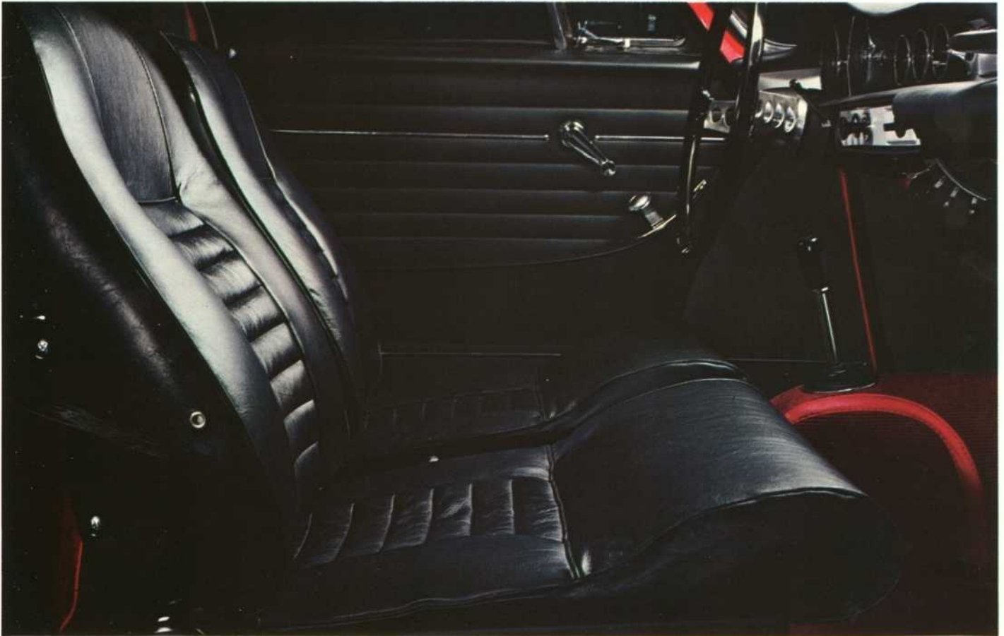
Comfortable, leather-upholstered seats. Fully adjustable. Even the support in the small of the back can be varied.