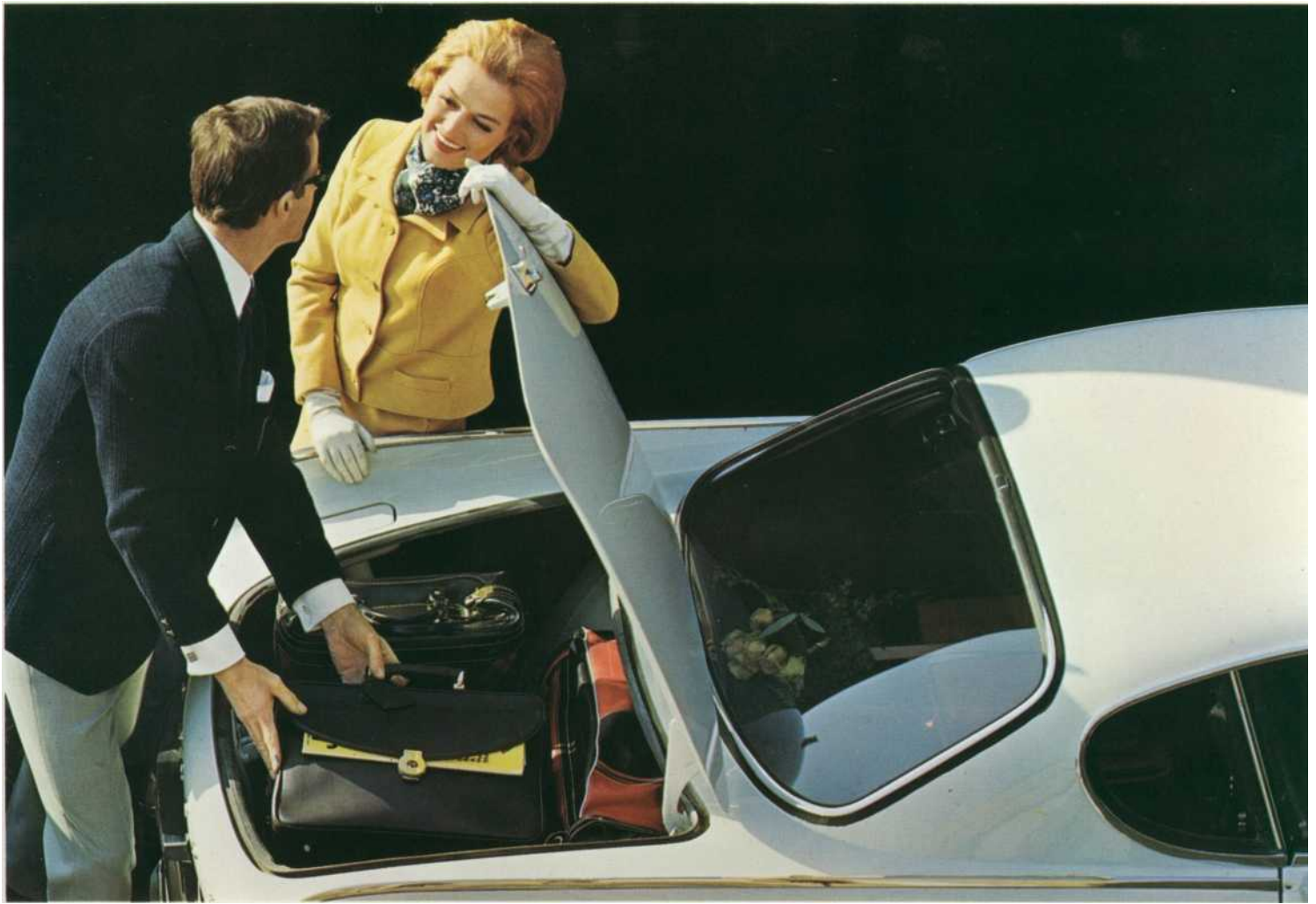
The trunk provides ample room for the amount of luggage two people carry.