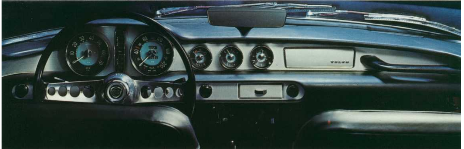
The instrument panel and padded dash are as good-looking as they are functional.