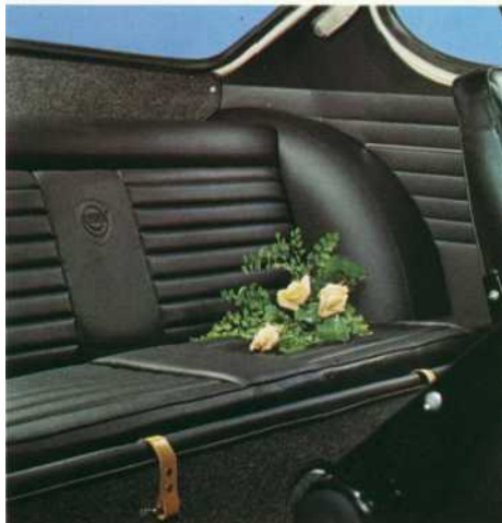
The occasional seat will carry two passengers ...