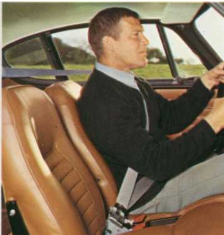
Three - point safety belts are standard equipment.