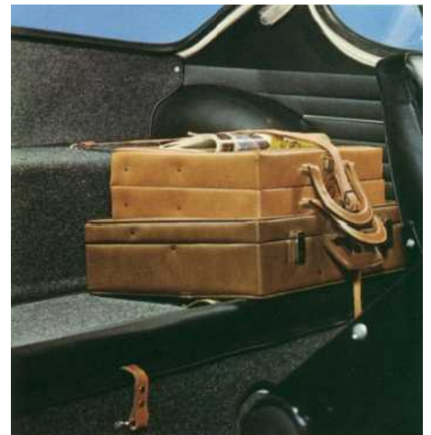
or fold down into a luggage rack.