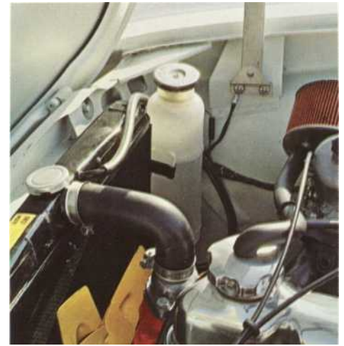
The sealed cooling system keeps the radiator from blowing its stack.