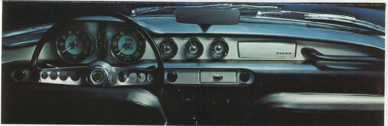
The instrument panel and padded dash are as good-looking as they are functional.