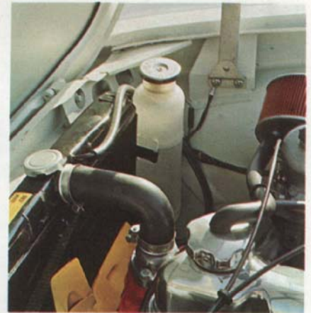
The sealed cooling system keeps the radiator from blowing its stack.