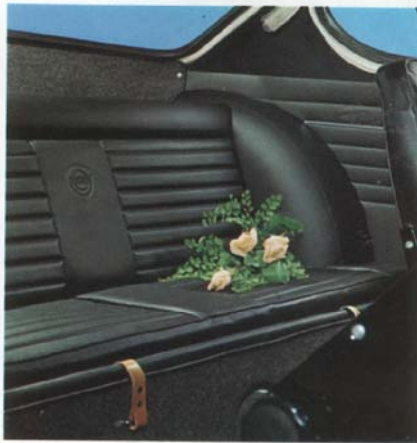
The occasional seat will carry two passengers . . .