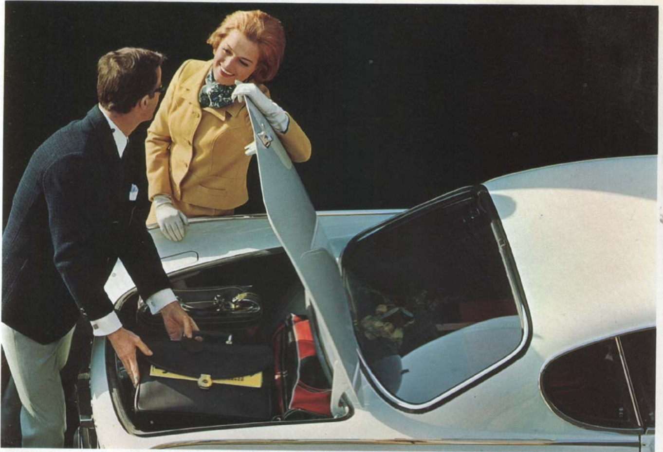
The trunk provides ample room for the amount of luggage two people carry.