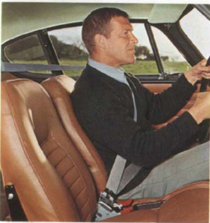
Three-point safety belts are standard equipment.