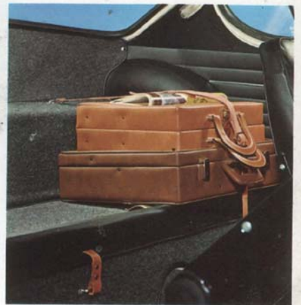
or fold down into a luggage rack.